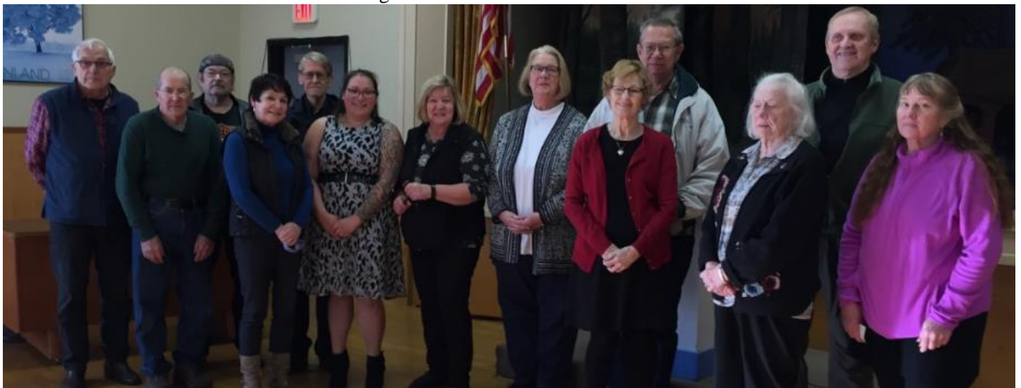
Lodge #2 Officers